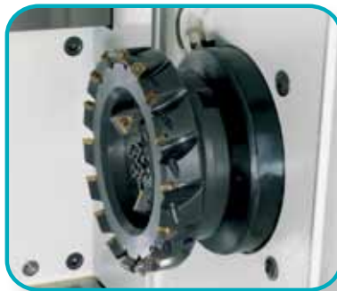
Cross slide unit for face milling and chamfering.