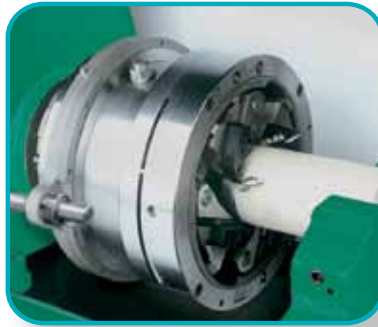
Longitudinal slide and spindle unit for tapping or thread rolling heads.