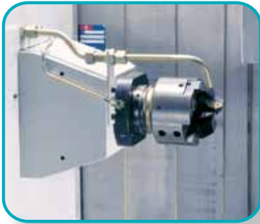
Longitudinal slide with toolhead for spotfacing and chamfering.