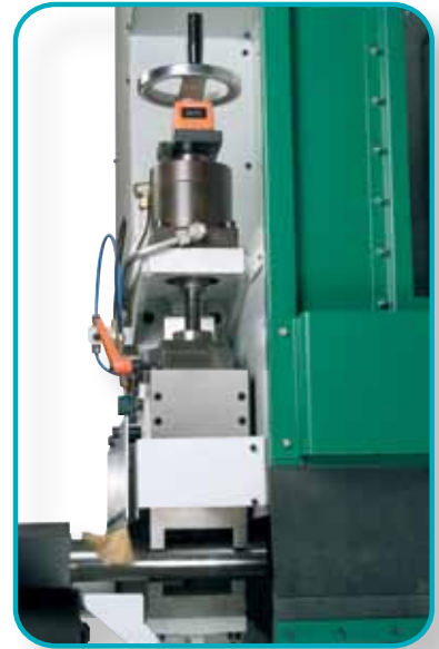
Rigid clamping device with adjustable stroke for reduction of cycle time.