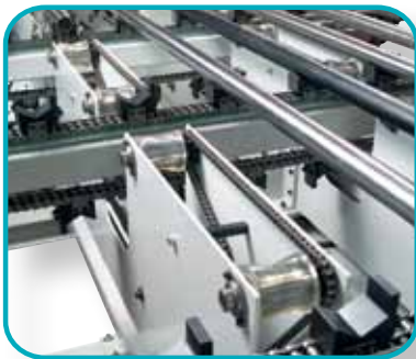
Chain conveyor with length movement for positioning and machining of rods at the left end and afterwards at the right end.