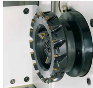
For face milling and chamfering: Cross slide unit