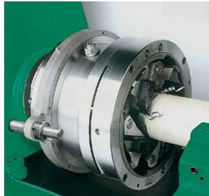
For use with thread cutting or rolling heads: Longitudinal slide unit