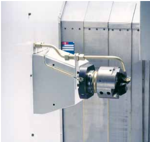
For squaring and bevelling: Longitudinal slide unit with a combination tool head