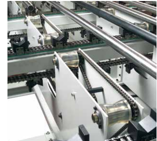
Step chain belt with a longitudinal roller conveyor and left-aligned workpiece limit stop for processing the first side, and a right-aligned workpiece limit stop for processing the second side