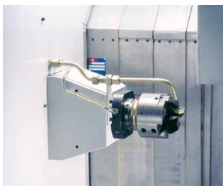
For squaring and bevelling: Longitudinal slide unit with a combination tool head