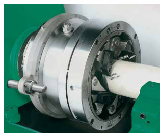
For use with thread cutting or rolling heads: Longitudinal slide unit