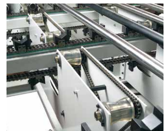
Step chain belt with a longitudinal roller conveyor for flush left and flush right workpiece attachment