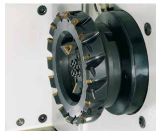
For face milling and chamfering: Cross slide unit