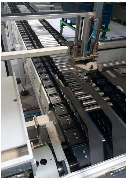
Feed conveyor belt with lifting and shaft inspection for diameter and length.

We can support you with our individual solutions. One example is the expansion of your processing machine with automated feed and discharge belts. We offer numerous options – individually tailored to your machine.