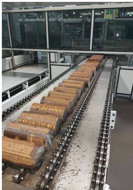
Feed conveyor belt with roller belt for variable diameters and lengths.