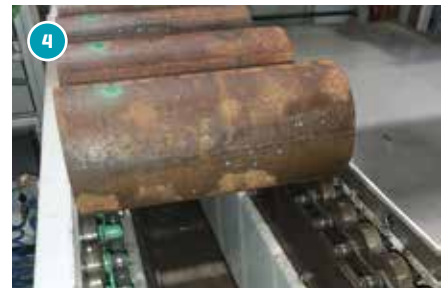
4) DISCHARGE CONVEYOR BELT Roller belt with width adjustment for variable diameters and lengths