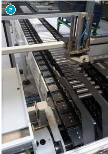
2) FEED CONVEYOR BELT with lifting and shaft inspection for diameter and length