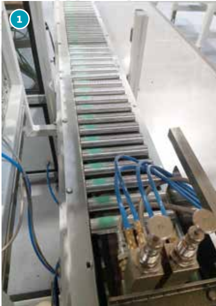
1) DISCHARGE CONVEYOR BELT with optional marking station for OK / NOK