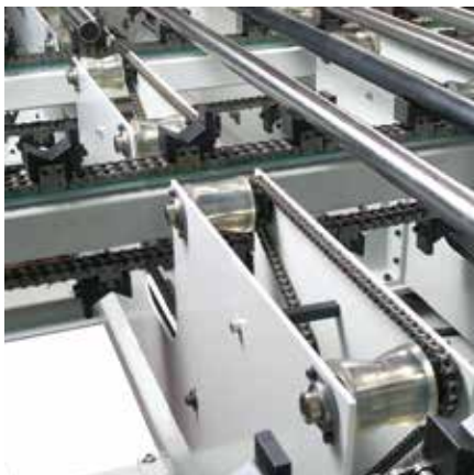
Step chain belt with a longitudinal roller conveyor and left-aligned workpiece limit stop for processing the first side, and a right-aligned workpiece limit stop for processing the second side.