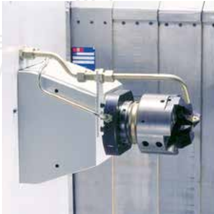
Longitudinal slide unit with a combination tool head for squaring and bevelling.