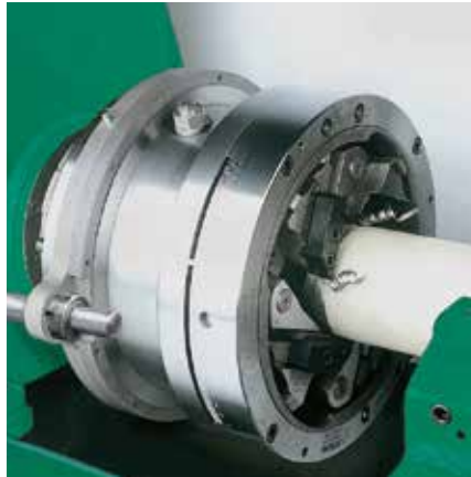
Longitudinal slide unit for use with thread cutting or rolling heads.