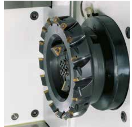
Cross slide unit for face milling and chamfering.